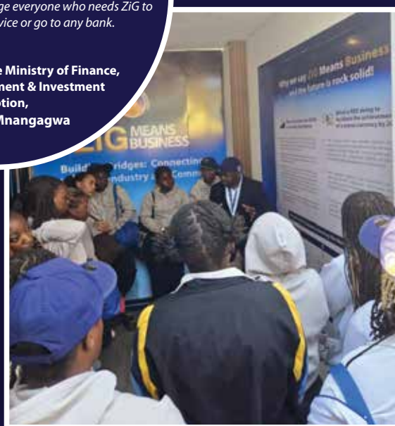
Top: The RBZ Award Winning Exhibition Stand at the Zimbabwe Agricultural Show displaying the “ZiG Means Business” campaign. Middle: Hon. David Mnangagwa, Deputy Minister of Finance (left) and other stakeholders (right) being briefed on RBZ’s policy measures during the tour of the Bank’s exhibition stand at the Zimbabwe Agricultural Show. Bottom: Stakeholders take part in close interactive ZiG sessions with RBZ officials at the Zimbabwe Agricultural Show.