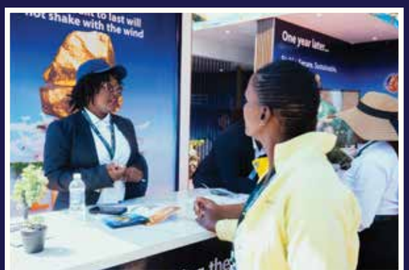
All above: Various stakeholders and visitors actively engage with RBZ officials through financial literacy discussions and interactive sessions on the “ZiG Means Business” campaign at the Zimbabwe Agricultural Show.